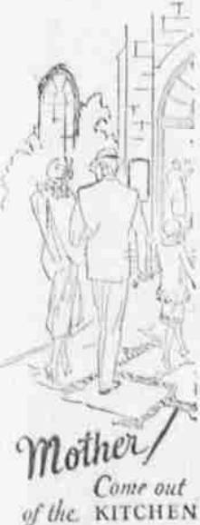
Mother Come out of the KITCHEN