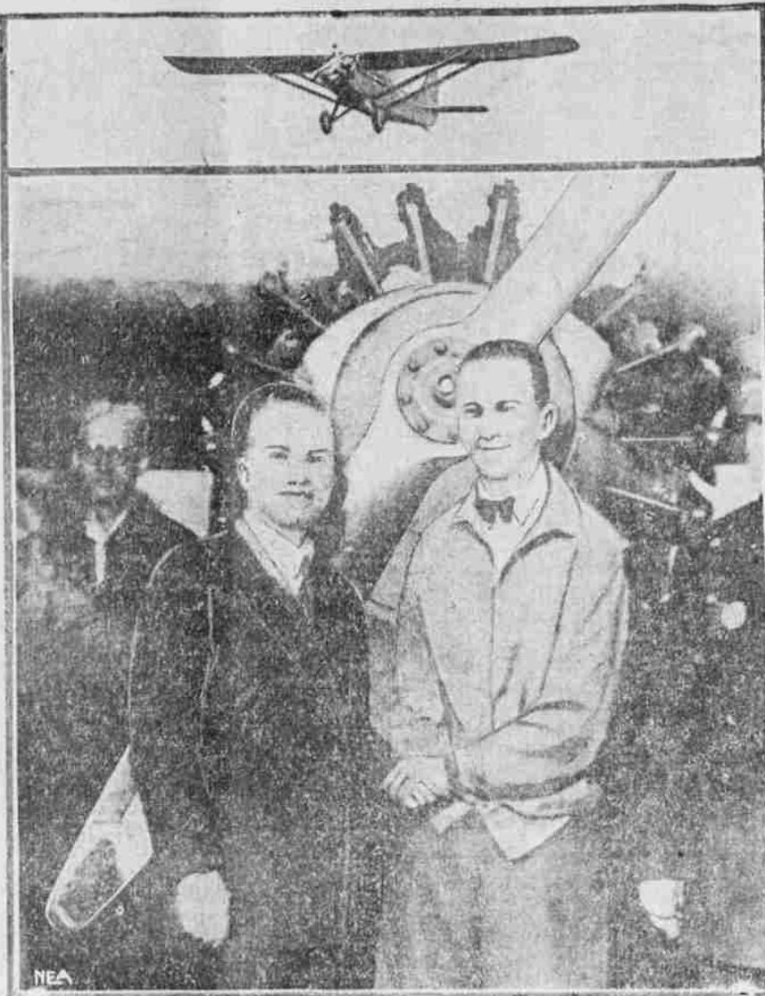
Aviators Clarence Chamberlin (right) and Charles Levine (left), who ended non-stop flight Monday, landing at Etzelden, 110 miles southwest of Berlin.