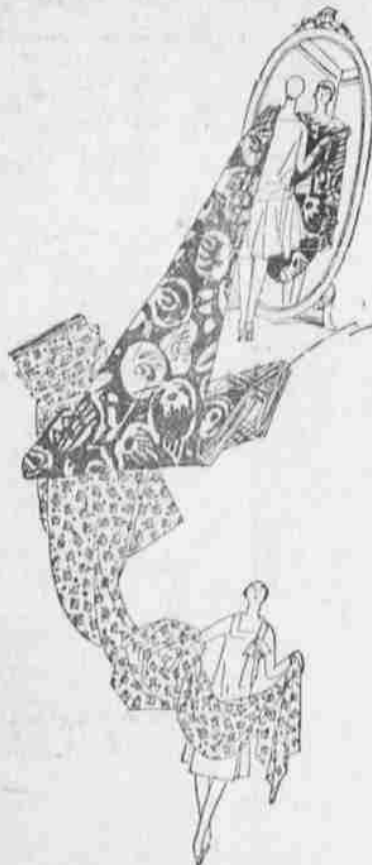
HUMMINGBIRD SILK ROSE

New Crepe de Chines, Too A very fine display of plain and figured crepes--the newest patterned pieces at $2.50 a yard--the plain crepes at $1.75.