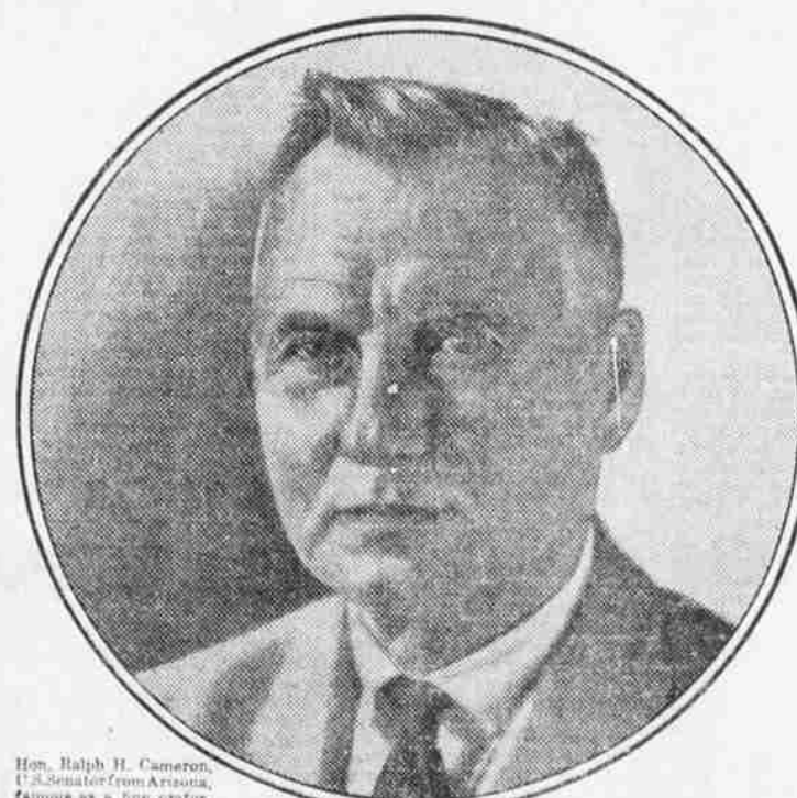
Hon. Ralph H. Cameron, U.S. Senator from Arizona, famous as a fine orator.

"Public speaking taxes the voice. One must think of the throat. I find, in smoking, that Lucky Strikes not only give greater enjoyment, but protect the throat." Ralph H. Cameron