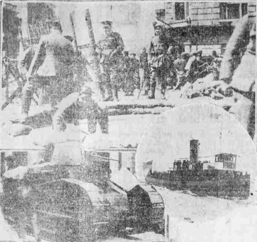
These are the latest scenes from the scene of Chinese civil war at Shanghai. Above, stand-by fortresses are erected by British and French and Japanese at almost every street intersection. Lower left, the French did the British one better by bringing in armored cars and tanks from Motocro, and the Dollar Line lines, brought over to the United States, bringing American marines ashore from the transport Henderson.

...the seizure had been made outside the jurisdiction of the court, which was asserted to extend only to the territorial limits of the United States three miles at sea.