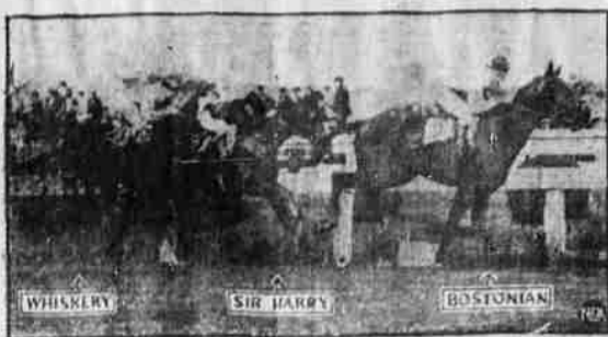
A magnificent burst of speed in the stretch put Harry Payne Whitney's 4-year-old Bostonian in front as the hunched field flashed under the wire in the historic Preakness stakes at the Pimlico track, Baltimore. The purse was $51,500.