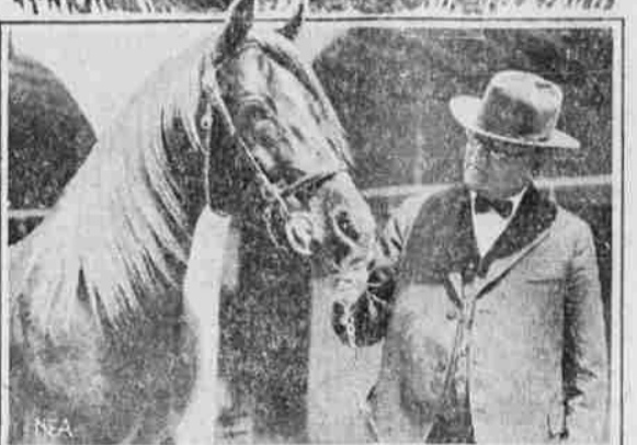
Stables of Arabian horses valued at more than a quarter of a million dollars have been thrown open to the public twice a week at Pomona, Calif. by their owner, W. K. Kellogg, the Battle Creek (Mich.) millinaire cereal manufacturer. Above is shown "Ben Hur," blooded Arabian, in action. Below is one of the few pictures of Mr. Kellogg ever taken. He is standing with "Ben Hur."