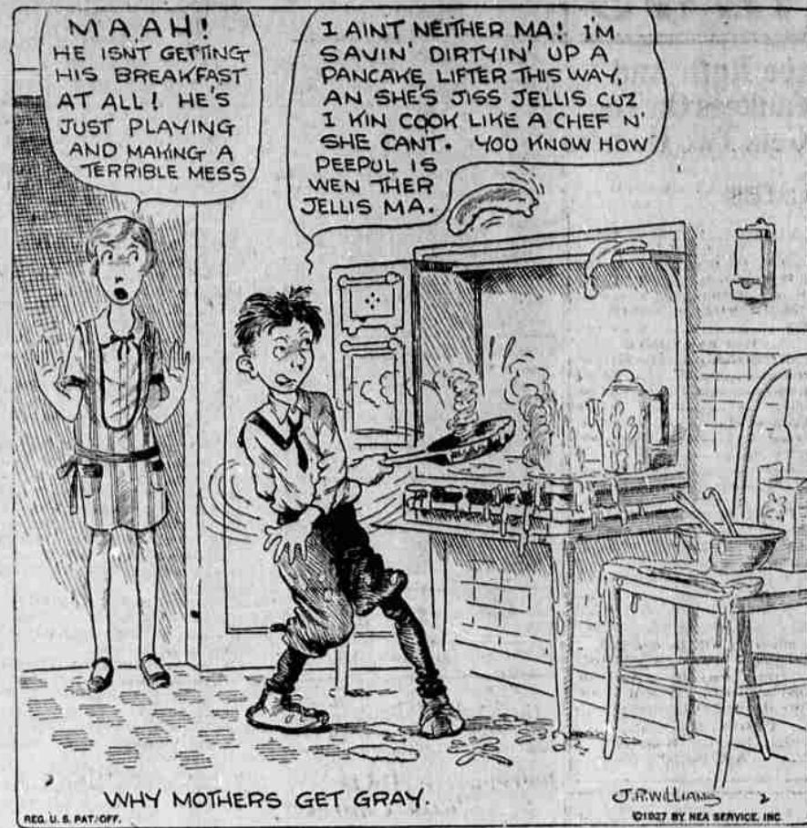
WHY MOTHERS GET GRAY. BY WILLIAMS. ©1927 BY NEA SERVICE, INC.