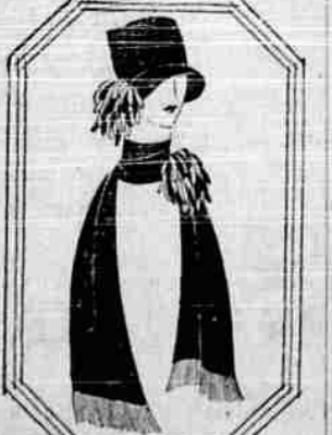
A wide black satin ribbon scarf, self-fringed, has a crepe de chine flower of black and white petals. The hat is of black felt with matching flower.