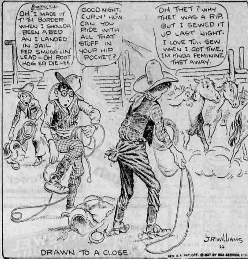
DRAWN TO A CLOSE.