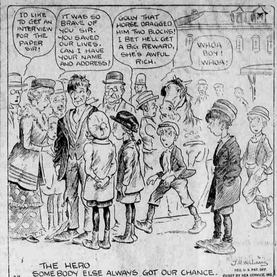
THE HERO SOMEBODY ELSE ALWAYS GOT OUR CHANCE.