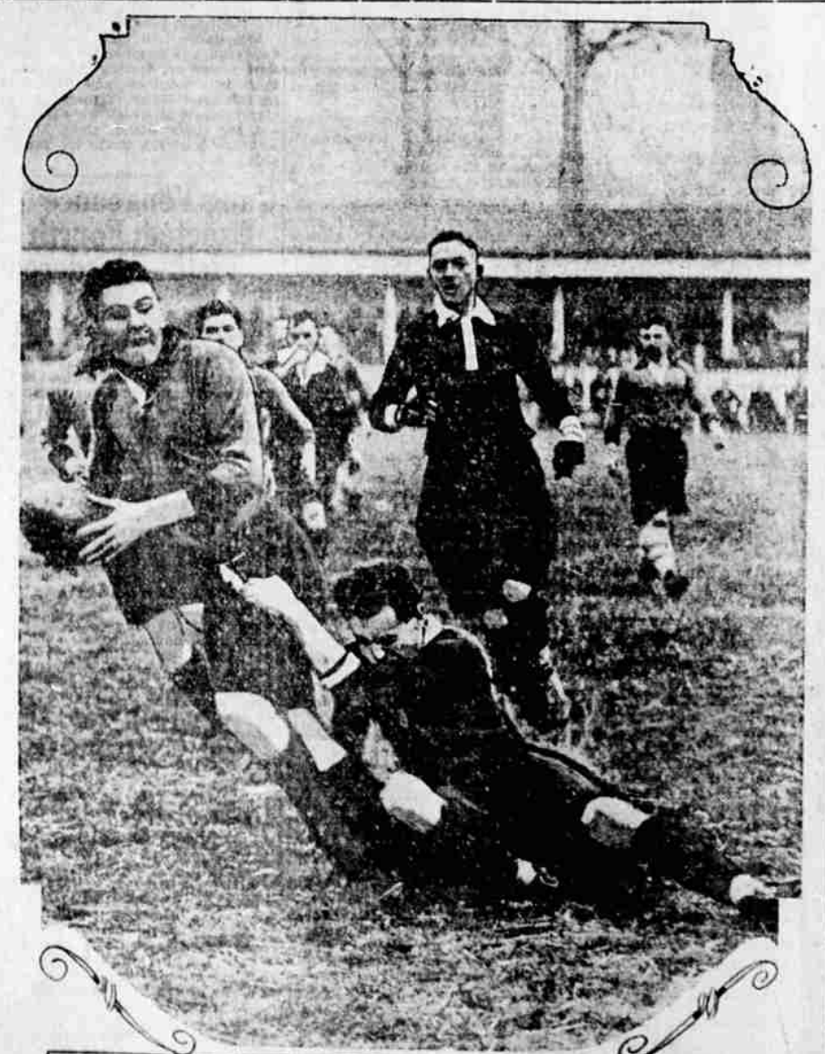
GERMAN RUGBY PLAYERS BATTLE AT OXFORD University for the first time since 1891. The Frankfurt boys lost to the Oxford Greyhounds, 22 to 2.