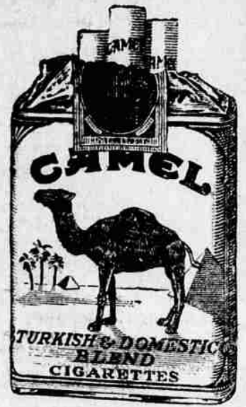
© 1927, R. J. Reynolds Tobacco Company, Winston-Salem, N. C.