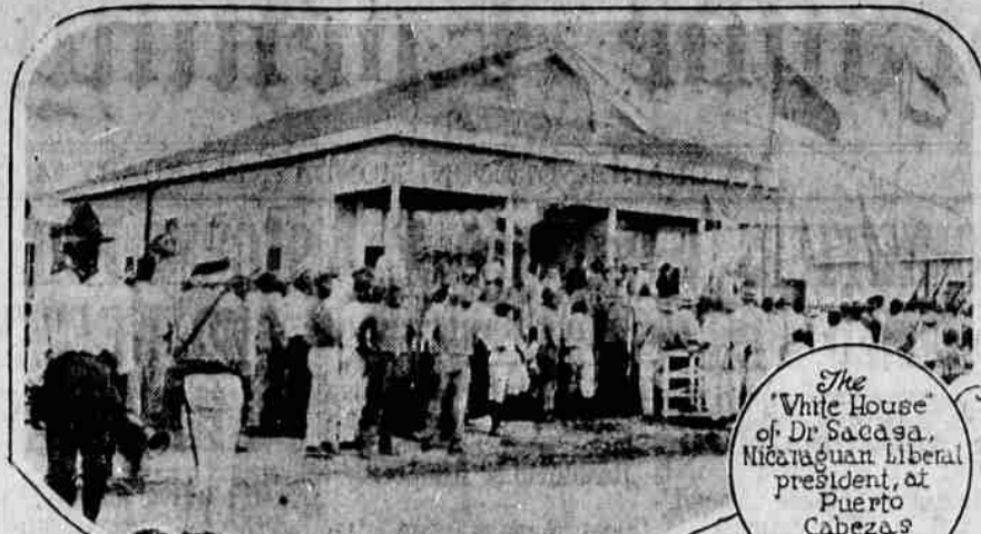
The 'White House' of Dr. Sacasa, Nicaraguan Liberal president, at Puerto Cabezas