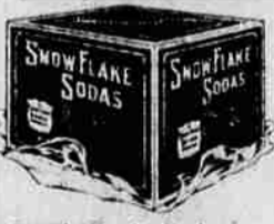
Buy the Family Package. Economical! Convenient!

plants and wax-wrapped in moisture-proof packages, giving you complete assurance of flaky crispness and delicious oven-freshness whenever and wherever you buy them. It is not by chance that Snow Flakes are the largest selling soda wafers in the West. At Ritzville, in Eastern Washington, we grow our own wheat, mill our own flour. We have one master formula and one rigid standard for all ingredients—Snow Flake quality never varies! Pacific Coast Biscuit Co., Seattle, Tacoma, Spokane, Portland, San Francisco, Los Angeles.