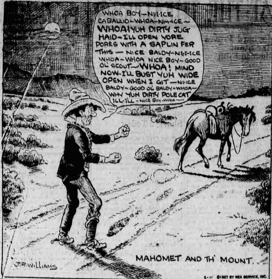
MAHOMET AND TH' MOUNT.