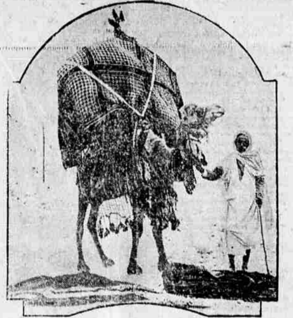
"TAXI, SIR?" Just a little slow, perhaps, but this Sahara taxi has several advantages—not the least of which is the absence of a meter. Two comfortable baskets are slung across the camel's back and completely covered with a saddle, ashade. The Arabian driver goes along on foot. He walks many a mile for his camel.