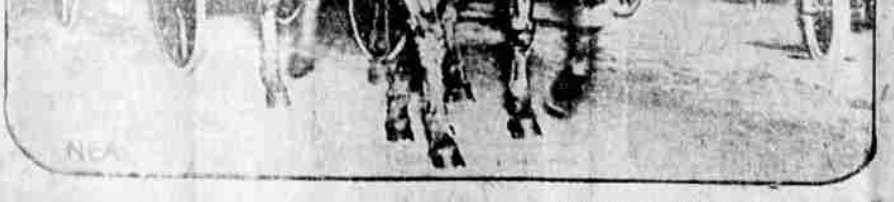
This NEA Service picture, the first to reach America, shows black horses drawing the creep-draped funeral hearse in which the remains of Emperor Yoshihito were taken to Tokyo from the royal villa at Royama where he died. Sand strewn deep along the highway deflected the sound of the horses' hooves.

"I wouldn't be without a Daylight Kitchen Unit daylight now that I have one"