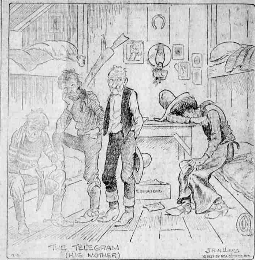
THE TELEGRAM (HIS MOTHER)