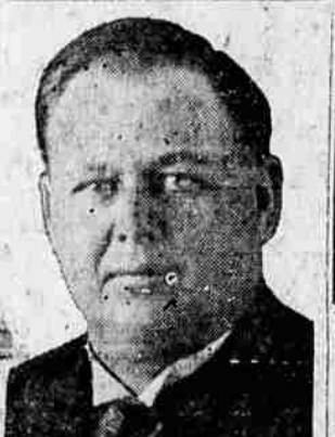
When you see the name ROYAL COAL it makes you have a warm feeling towards it, especially if you have ever tried it. I made a trip to Portland lately and I noticed that some of the leading coal dealers along the coast run a big sign "ROYAL COAL". If I had not been in such a hurry, I would have gone in and congratulated the men with a good warm handshake. We are certainly pleased with our sales on the ROYAL COAL and our many satisfied customers. Royal Coal is clean and hot, very light in ash, burns longer, less trouble and is absolutely guaranteed. If you do not like Royal Coal better go to the doctor and have your head analyzed. Royal Coal is the coal where you take it away and furnish your own sacks. Royal Lump is $12.50 per ton delivered or $11.50 a ton where you haul it away. A man came in the office the other day and said, "Your Royal Coal is no good. It smokes." I told him that his fire must be stopped up. "No," he said, "the fire is all right." "Well," I told him, "We have no trouble in our stove," and we were just about ready to take him over to the house to prove to him that the coal did not smoke and all he had to do to convince me, was just to point his finger at our big brick chimney, and remark, "Don't you see the smoke coming out?" He had a good hearty laugh and ordered some more ROYAL COAL.