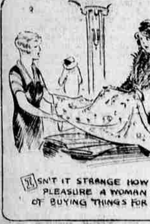
ISN'T IT STRANGE HOW MUCH PLEASURE A WOMAN GETS OUT OF BUYING THINGS FOR HER HOME