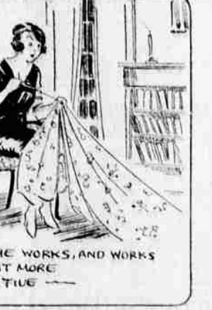
TAKE THE WINDOW CURTAINS FOR INSTANCE—KEAT, SPIC AND SPAN ONES ALWAYS MAKE THE PLACE LOOK FINE FROM THE OUTSIDE