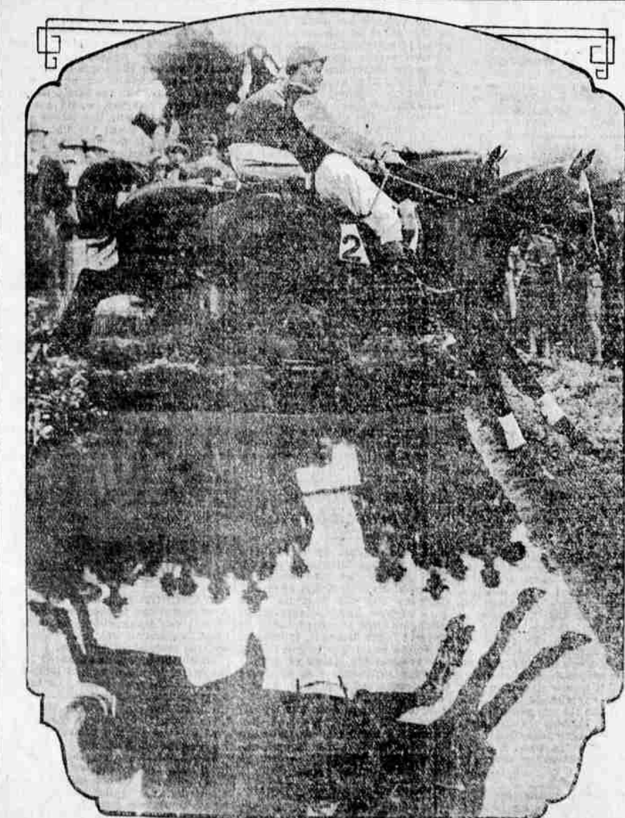
TAKING THE WATER JUMP. This remarkable action picture was taken during the recent fall steepchase in Worcestershire, England. The reflection of the horses' flight is shown in the water.

Some day some flatterer is going to take a shot at the king of Italy.