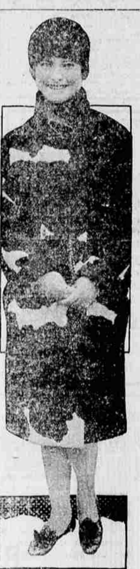
HERBIE LOIS MORAN, former movie star, as the camera saw her in New York just after she returned from London.

NEW YORK, Jan. 17 (AP)—Officials of the Northern Pacific, the Great Northern and the Chicago, Burlington and Quincy were