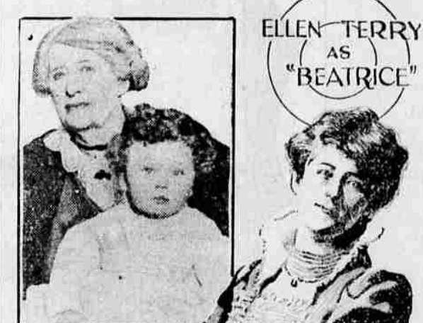
DAME ELLEN and her GREAT GRANDCHILD

Ellen Terry, whose reign of half a century on the British stage won her acclaim as England's greatest Shakespearean actress, is reported dying. This shows her in a recent post and as she looked in her most famous role—that of Beatrice in "Much Ado About Nothing."