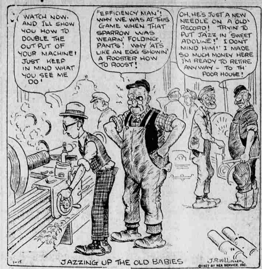
JAZZING UP THE OLD BABIES