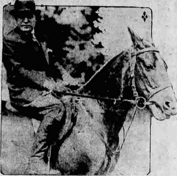
It's the reins of government he holds which make Premier Mussolini the cynosure of all Europe. Particularly since the outbreak into open charges of the long-current rumors that Italy is arming with its eye on France.

next three months he will address gatherings in Los Angeles, Iowa and Colorado and as he expressed it, he "hopes to continue to carry the banner of Oregon to foreign lands."