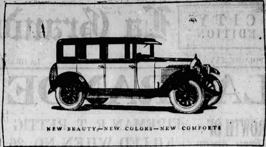
NEW BEAUTY—NEW COLORS—NEW COMFORTS