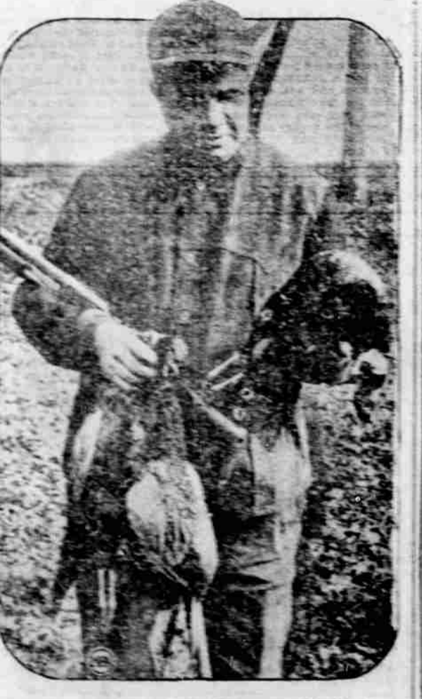
Being "out a day" in woodville didn't prevent Babe Ruth from getting a chance at hunting, his favorite recreation, when he was in Washington recently. Friends arranged a pheasant shoot for him, and he bagged the bird. Yes, Babe had a hunting license too.