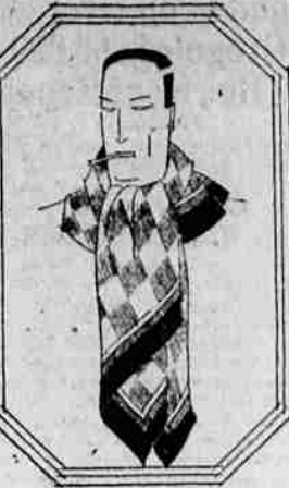
A large square of sash silk in tones of gray makes an attractive scarf for the conservative man.