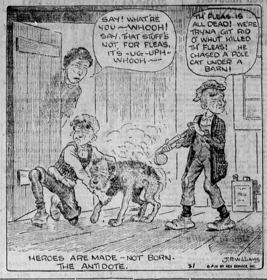
HEROES ARE MADE -- NOT BORN. THE ANTIDOTE.