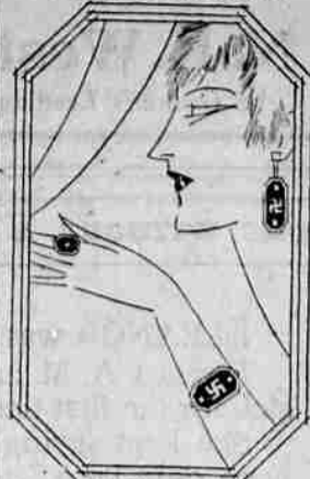
A silver swastika design set in black enamel makes this unusual sport set of earrings, bracelet and ring.