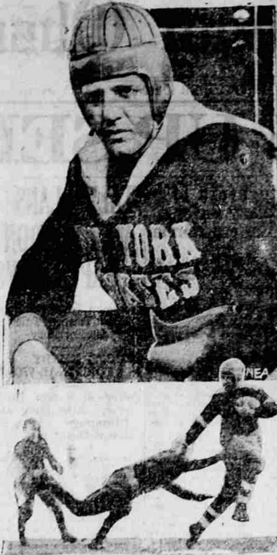
Here you see the great "Red" Grange as he looks in the professional football suit of the New York Yankees. The galloping rooster, red, red, crimson creek or what have you, is all set for a big campaign. Inset shows "Red" in action during the second game between the Yankees and Cleveland Panthers at Cleveland. Grange has just been tackled after a short dash.