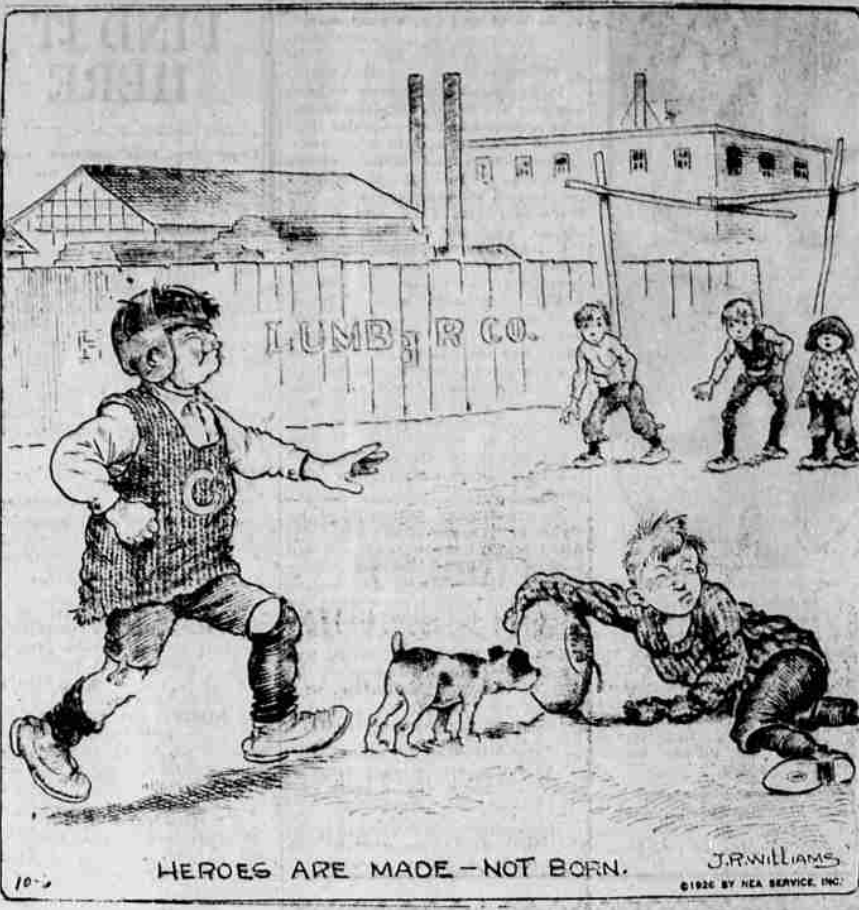
HEROES ARE MADE—NOT BORN.