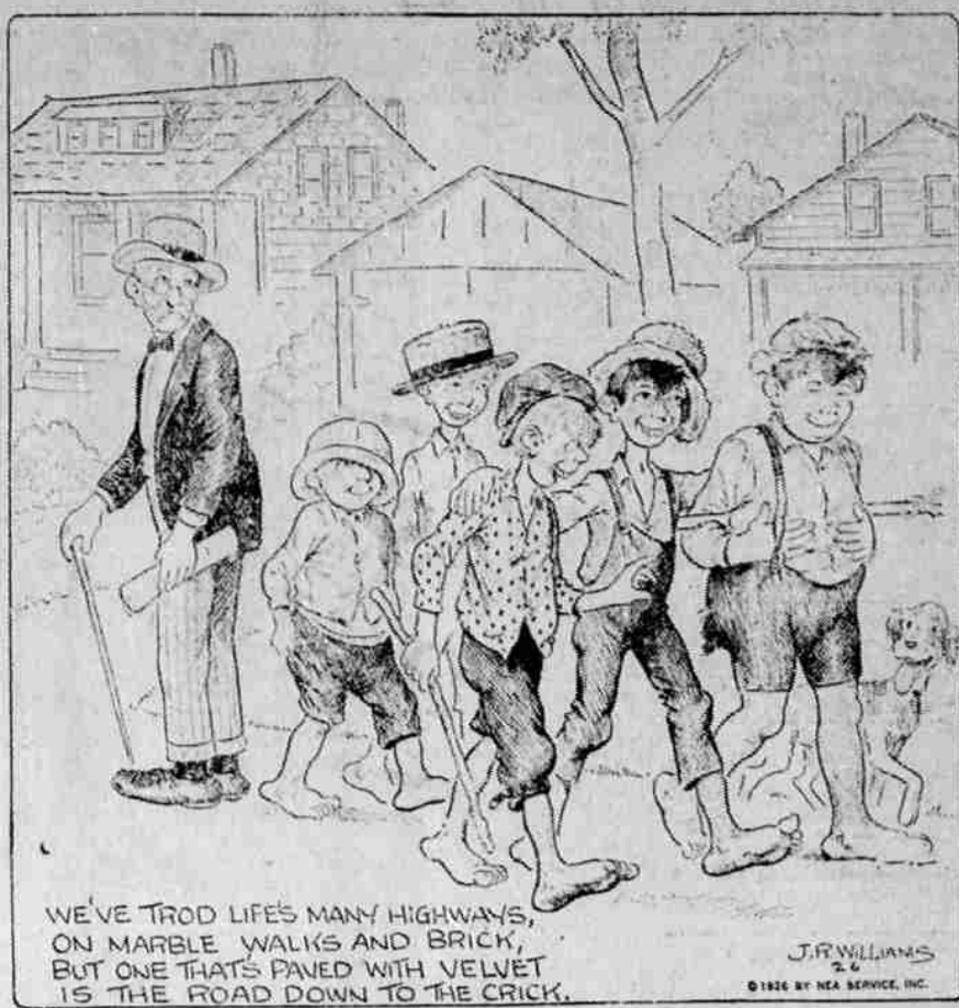
WE'VE TROD LIFE'S MANY HIGHWAYS, ON MARBLE WALKS AND BRICK, BUT ONE THAT'S PAVED WITH VELVET IS THE ROAD DOWN TO THE CRICK.