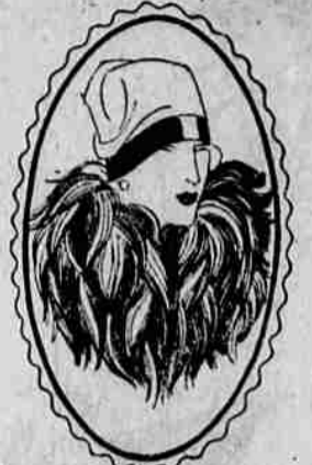
France sponsors this catfish feather boa, which first appeared in great numbers at the Auteuil races.