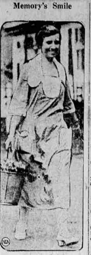
Mrs. Calvin Coolidge, garbed in simple house dress, carrying a pair of flowers to the grave of her son, Calvin Jr., in the Plymouth, Vt. cemetery.