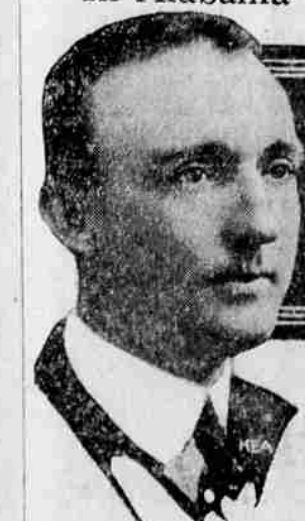
This is Judge Hugo Black, nominated by the Democrats in Alabama for Senator Underwood's place in the U. S. Senate. Underwood, who is retiring voluntarily, fought the Klan Black is reported to have run with Klan endorsement.