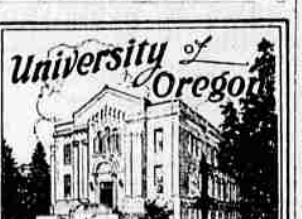
A thorough cultural and professional scholarship is the outstanding characteristic of the State University.

THE American people will not tolerate a continuance of Newberryism. They have shown that by the defeat of nearly every senator who voted to seat him.