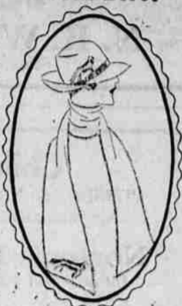
The fold of this two-tone green velvet beret is held in place by a band of crushed velvet and an arrow of rhinestones and emeralds.