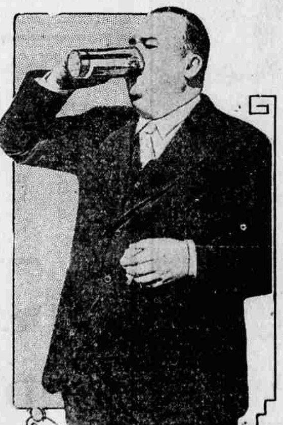
PAUL WHITEMAN and the photograph was taken by him, so it must be near here he's inhaling. The jazz king and his orchestra are touring Europe.

STANDARD OIL COMPANY OF CALIFORNIA ORONITE Cleaning Fluid (NON-EXPLOSIVE)