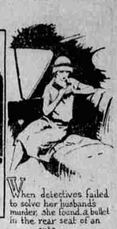
When detectives failed to solve her husband's murder, she found a bullet in the rear seat of an auto