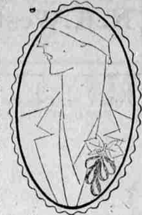
Channel sponsors this newest boutonniere, made of crystal. The cluster of grapes is of chrysanthemum green with silver leaves.