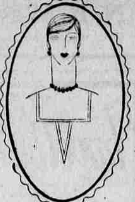
The newest among necks in the square trimming with a triangle cut out in front and finished with a straight line in back.