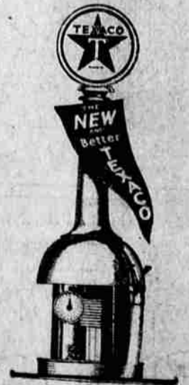
Every Texaco pump now dispenses the new and better Texaco Gasoline.