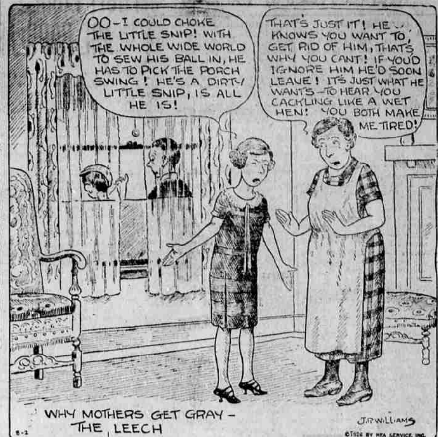
WHY MOTHERS GET GRAY—THE LEECH