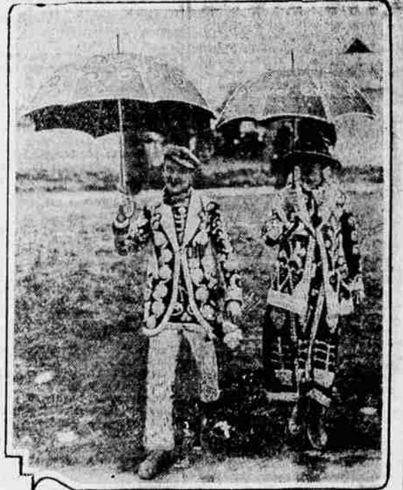
BEHOLD THE PEARLY KING AND QUEEN as they appeared at the Downs at Epsom for the recent race meeting. They have come for several years in these "sat" costumes.

A DECLARATION To render the most dependable and courteous service * To the greatest possible number of people * At the lowest cost consistent with fair wages to the labor and capital employed * Giving and deserving fair treatment * thus To be a factor in uplifting this community * Is the objective of this company. Do you want ice? Electricity will make it. Are you hungry? Roast or bake or broil on your electric range. If you wish you may cook your eggs or toast your toast at the table. Do you want heat, light or power? They come in every room at the touch of your finger. Wonderful as these things have been and are, progress in electric development is continuous. Scientists never lose interest in improving their homes—and yours. As quickly as new electric applications become practical this company makes them available to you.