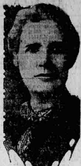
MISS SUSAN LAWRENCE, member of Parliament, has a smoking room all to herself. She is one of the four women members of the House of Commons, and since the others do not smoke, she has exclusive use of the room.