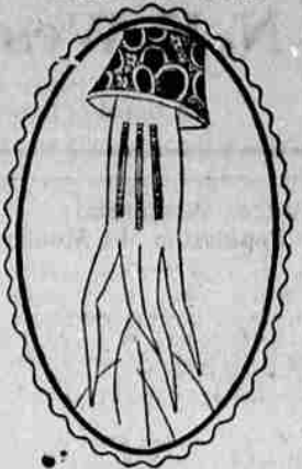
A new cuff for fall wear is of great embroidery with the colors repeated in the back stitching.