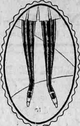
Vertical stripes such as these distinguish fall wool hose. They are in three colors on a heather background.