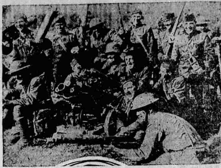
Above is pictured a scene from "On Flanders Field," World war picture which will be shown at the Star theater today and tomorrow, under the auspices of the American Legion.