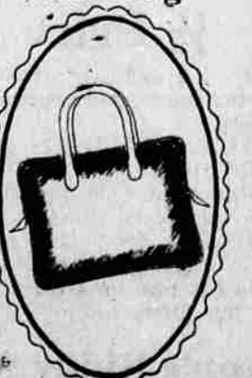
For the summer traveler is this "pillow" bag. It is of soft, grained material, padded to pillow proportions, with four pockets inside and a zipper fastening.