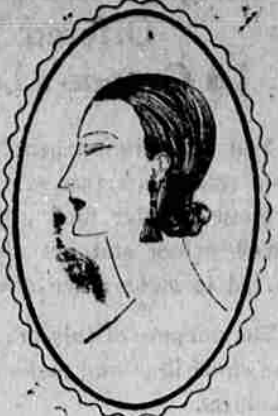
For the growing bob and the girl who does not wish to wear a transformation.