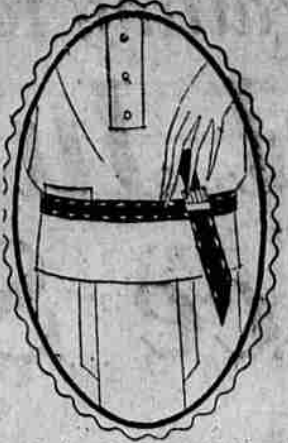
A leather belt with a shield at its side for a fan in the shape of a knife is a novelty for use with tailored or sports clothes.