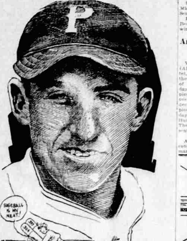
HAZEN CUYLER AFTER ONLY TWO YEARS IN THE MAJORS HE GOT A THOUGHT TO HIS OWN POSSIBILITIES

One of the greatest youngsters to come into the big leagues in recent years is Hazen "Nik" Cuyler, famous Pittsburg outfielder. Cuyler joined the Smokey Town club late in the 1923 chase. He's been going like a house afire ever since.