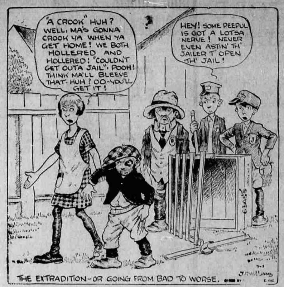
THE EXTRADITION—OR GOING FROM BAD TO WORSE.