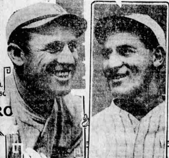
Samuel Bohne, left, and Andrew Cohen are the only representatives of the Jewish race in the National League. Oddly enough, both are infielders. Bohne being a shortstop for Cincinnati and Cohen a shortstop and second baseman with the Giants. In the American League, Buddy Meyer is the lone Jewish boy. He, too, is an infielder, playing third and short for Washington.