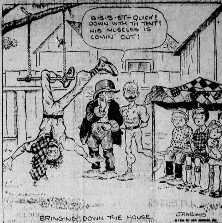
BRINGING DOWN THE HOUSE.