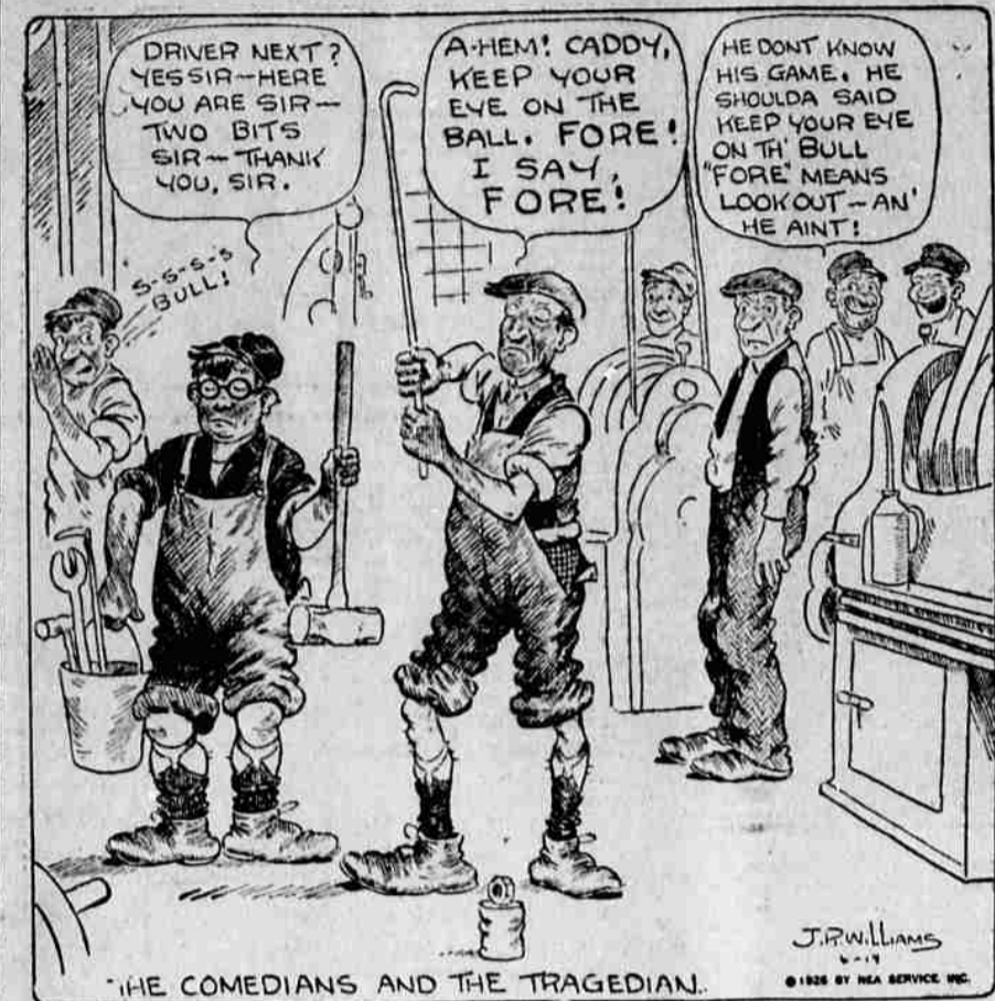
THE COMEDIANS AND THE TRAGEDIAN.