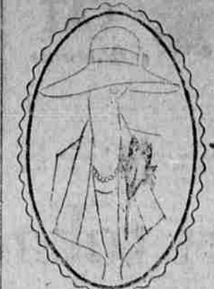
Novelty Boutonniere imported from England is made of this washable rubber and perforated for six months.