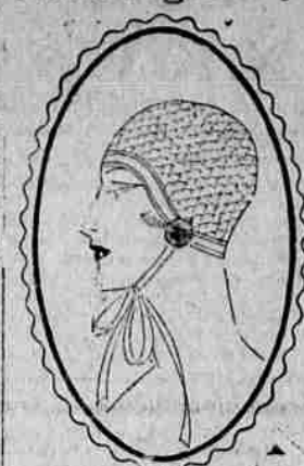
A filmy night cap of silk mesh veiling especially designed to hold the waved bob in place.

swimming party at Cove last evening. Four cars, with about twenty people, left the shore shortly after 6 o'clock for the Cove swimming pool, where they enjoyed about an hour in the water. Lunch was served after the swim and the party returned to La Grande, arriving here about 9 o'clock.